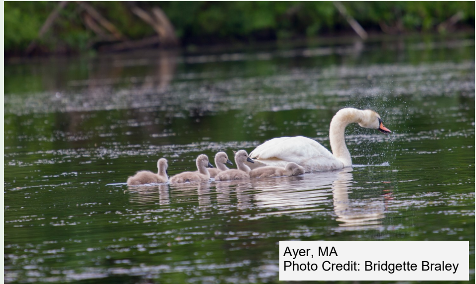
Ayer, MA

Greetings from the Nashoba Associated Boards of Health!