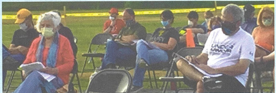
June 22, 2020 Town Meeting.

If uncertain, check with the Town Clerk to ensure you are already registered to vote.