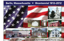
Postcard Logo by Eileen Heifner

Merchandise was designed and is now available for sale in the Town Clerk's office and at Indian Head Farm. Funds raised from the sale of these products will help offset the expense of supporting these activities (see order form on inside.) A cookbook is currently in production and will be printed late fall. We are still looking for recipes and have included a submission form on the back page.