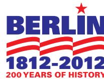
Cancel Stamp Logo by Lori Fearebay